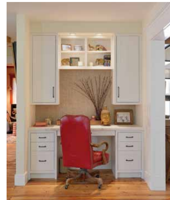
Function and charm around every corner. Making the most of the transition from kitchen to family room, the built-in office has file drawers and closed cabinets for function, and open display shelves to bring charm to what might otherwise be a utilitarian space.