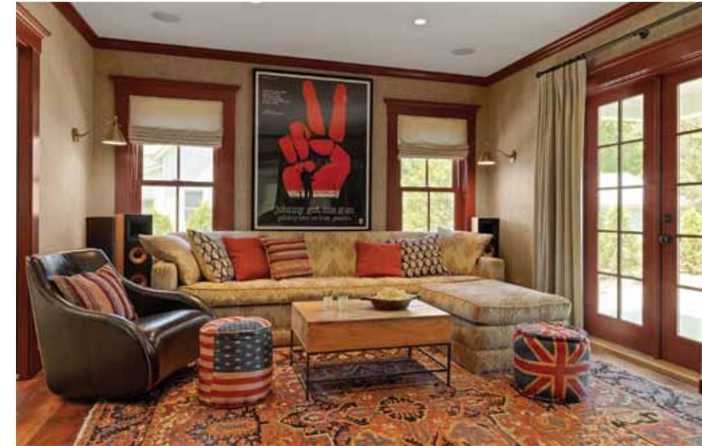
The jewel-box effect. The den is the only room in the house where the trim color is not white. Interior designer Annette Tatum calls this the "jewel-box effect" and says that the rich color will invite people to this room. The double French doors draw in light and draw people out to the back porch.

Chris has a unique view on this project, having remodeled the same house 18